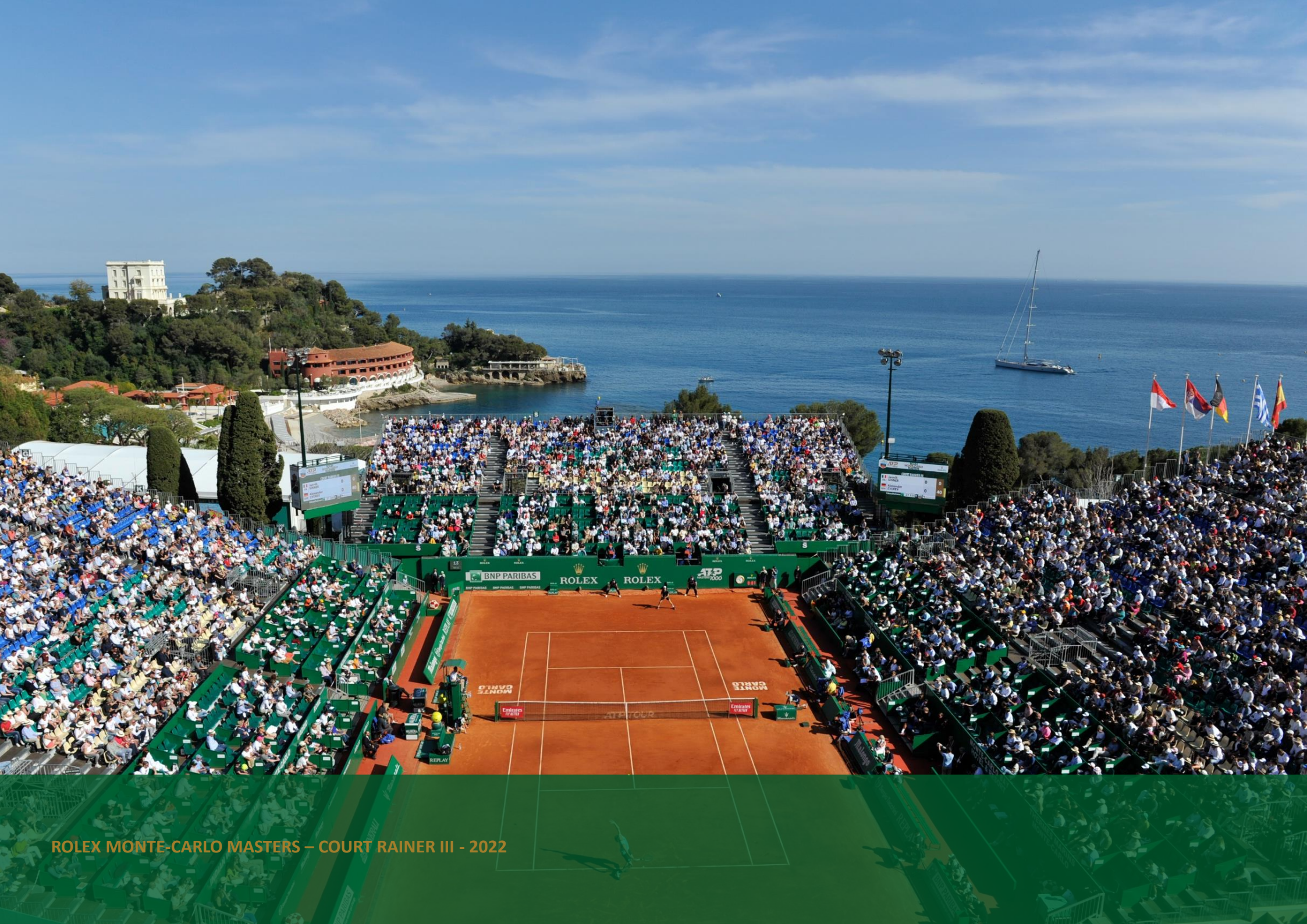
ROLEX MONTE-CARLO MASTERS – COURT RAINER III - 2022