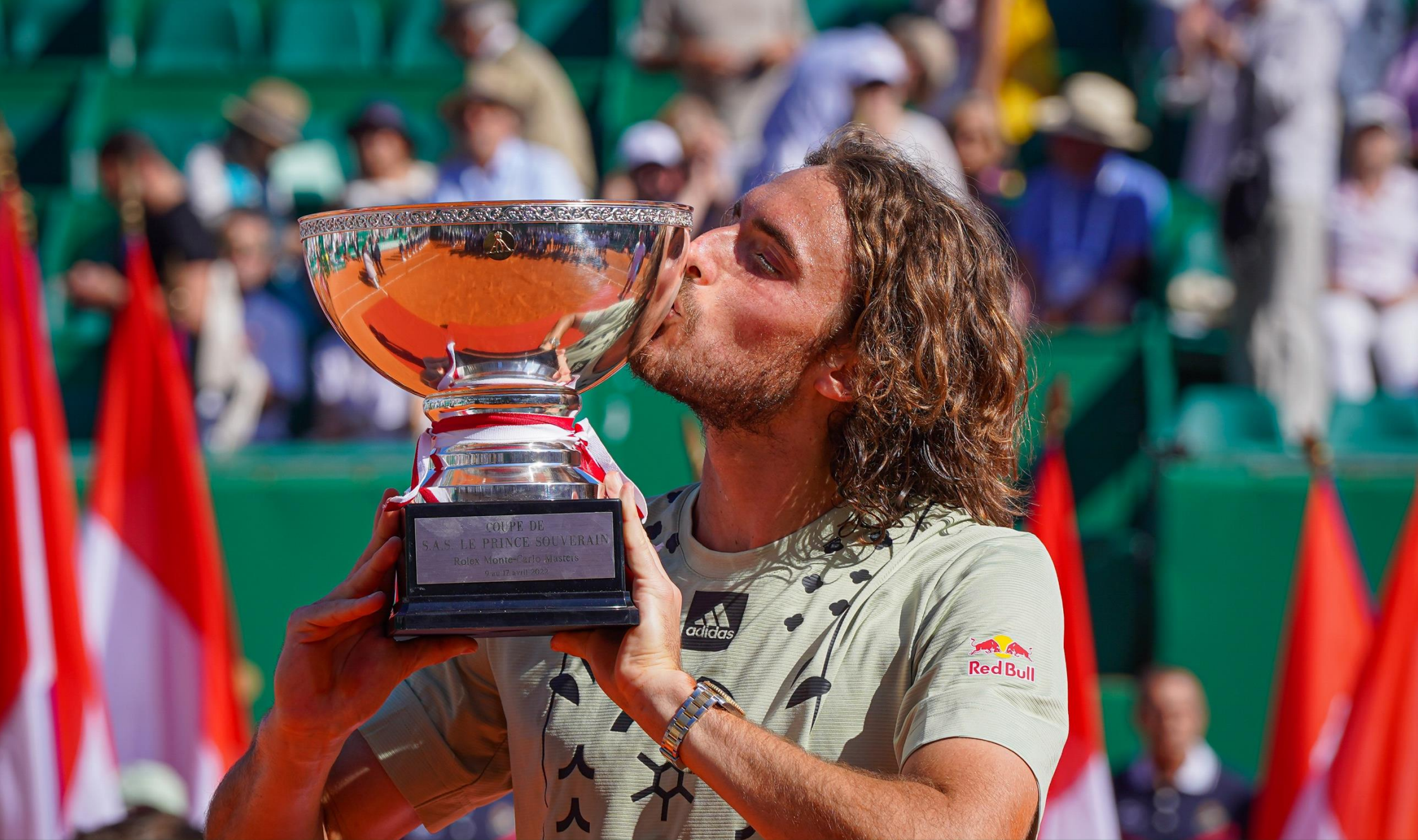
2022 CHAMPION — STEFANOS TSITSIPAS